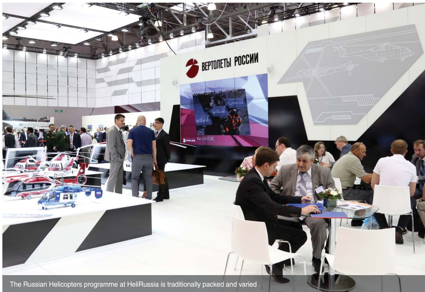
The Russian Helicopters programme at HeliRussia is traditionally packed and varied