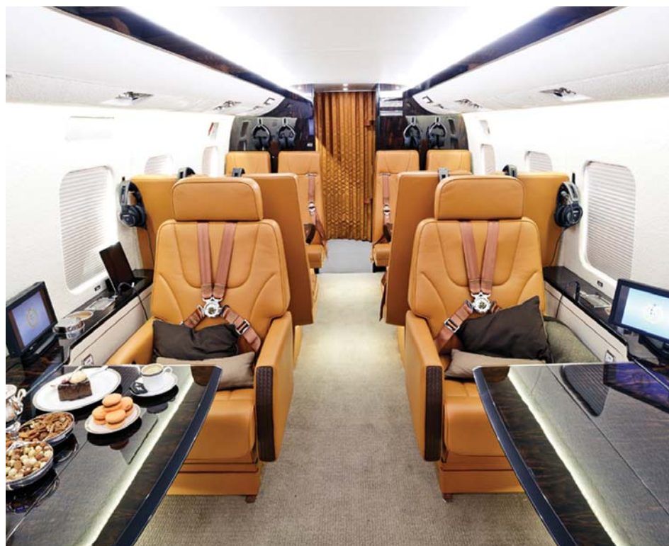
The legendary Mi-8/17 series is a firm favourite in the corporate and VIP transport market

A wide model line-up of civil and military helicopters which are most needed today at the world's market of medium-class helicopters will be demonstrated to experts and visitors. In keeping with tradition, this year Russian Helicopters Holding Company has prepared for demonstration the models of helicopters that in the next two or three years will present a new image of the company's line-up, they include: the Mi-171A2, an advanced medium multirole helicopter, created on the basis of the renowned Mi-8/17 series of helicopters with the use of the latest technologies and materials; the Mi-38, a Mi-family helicopter of the new generation in the medium-heavy category with a takeoff mass of 15.6 tons; the Ansat helicopter, which claims to be the most needed utilitarian helicopter for the business and service sector; the EASA-certified Ka-32A11BC, a recognized "expert" of construction-and-assembling works and firefighting; and the Mi-28NE attack helicopter.