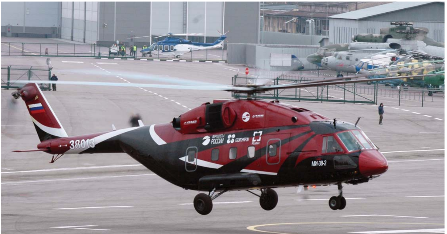
The Mi-38 passenger transport helicopter

Another important advantage initially included in the configuration of the helicopter, is that thanks to the cabin volume, the Ansat can include a host of modifications. The basic transport and passenger version is designed to carry up to 10 passengers or 1,000 kg of cargo inside the cabin or 1,300 kg on external sling.