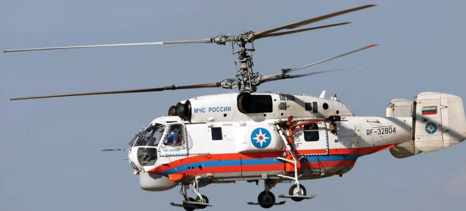
The multipurpose Ka-32A11BC civilian helicopter with coaxial rotor

able, including Bambi-Bucket and Simplex fire-fighting systems of various capacities, water cannons for horizontal fire-fighting, turret water cannons and stowable lifting cabins for transportation and rescue operations. In the early 2000s, Kumapp in Kumer-tau developed a horizontal telescoping water cannon for the Ka-32 series that can shoot a stream of water about 40 meters. The first production Ka-32 helicopter with a water cannon of this type was delivered to South Korea in November 2005. With every new mission, pilots learn more about the unique capabilities of the Ka-32A11BC helicopter. For example, it can put out fires in dense urban areas that are out of the reach of fire trucks, as was demonstrated at the Moscow City Complex where, in April 2012, one was used to put out a fire that had engulfed over 300 square meters of a skyscraper at a height of 67 floors (270 meters). It's no exaggeration when the company's engineers claim that the Russian-built 32A11BC fire helicopter with horizontal water cannon can extin-