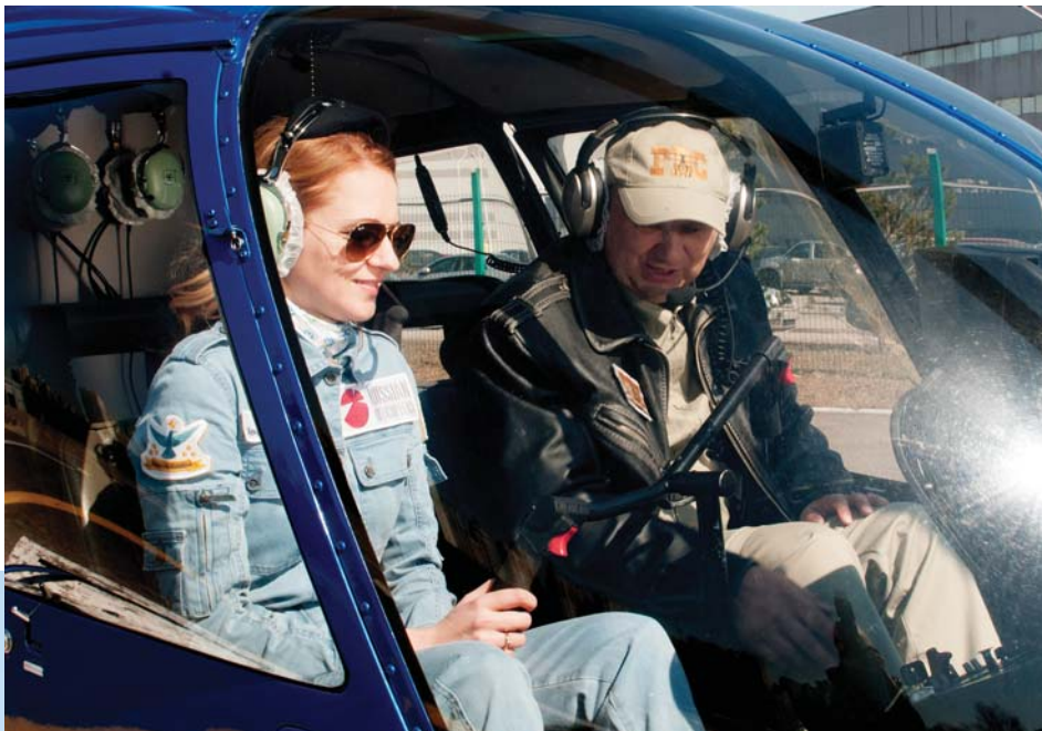
ATS RHS offers its students a full range of training courses

ATS RHS offers its students a full range of basic training courses in aircraft handling for clients with different levels of experience, from “beginner” to “advanced.” The most valuable and responsible offer is the package of basic and complicated safe flight classes called “Safety Course.” The center is fully compliant with the aviation legislation of the Russian Federation. All pilots/instructors possess necessary permits and certificates. The female helicopter squadron called Calibri is a special point of pride for the RHS Aviation Training Center.