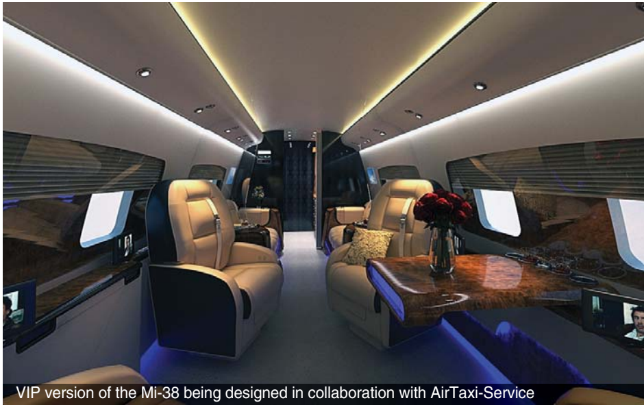
VIP version of the Mi-38 being designed in collaboration with AirTaxi-Service

has the two-channel PKV-171A digital autopilot, modern means of communication and GLONASS / GPS navigation. It is planned to equip the helicopter with a laser radar that will provide the recognition of a cable up to 5mm in diameter at a distance of 1,000m – a feature that will significantly improve the flight safety at low altitudes.