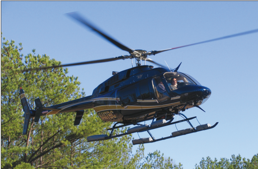
Wire strike protection system (WSPS)-equipped Bell 407 operates at low altitude. As a last line of defense, WSPS can lessen the consequences of a wire strike accident by slicing through the cable.

when covering large geographic areas—and it is important to understand that not all power lines and towers are charted. High-altitude reconnaissance flights will aid the pilot in locating towers and wires, but maintaining a high level of situational awareness is difficult while flying single-pilot during periods involving multiple distractions—both internal and external—such as radio communications or searching for airborne traffic.